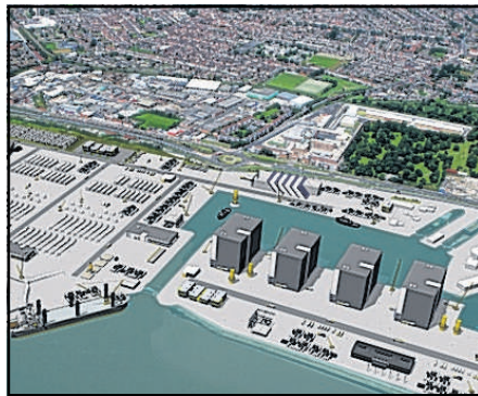
HERE FOR LONG HAUL: Siemens new plant at Alexandra Dock could open in 2013.

Staff at the factory will be constructing 5,000 turbines destined for massive offshore farms in the North Sea.